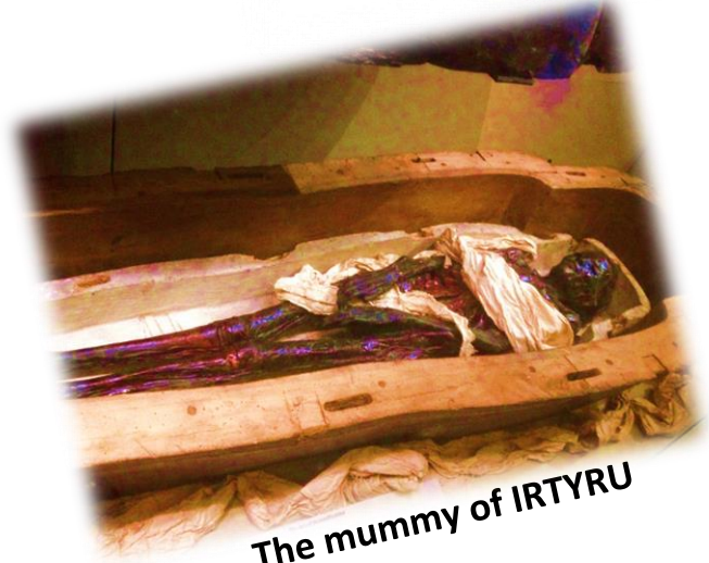
The mummy of IRTYRU